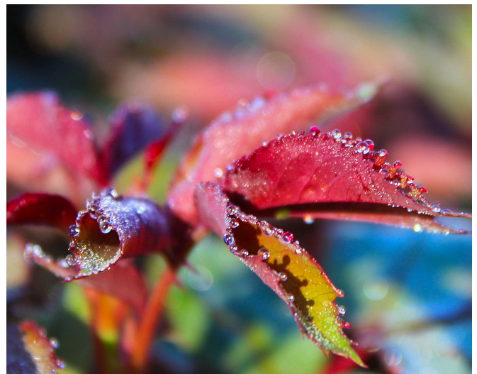
Color Digital by Debbie Tromblee