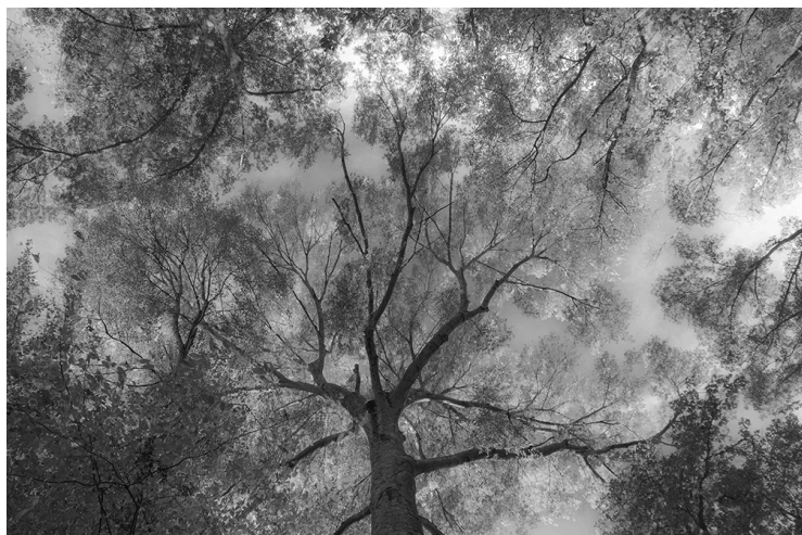
Monochrome Digital by Barb Montgomery