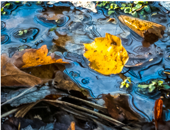
Color Print by Don Wolfe